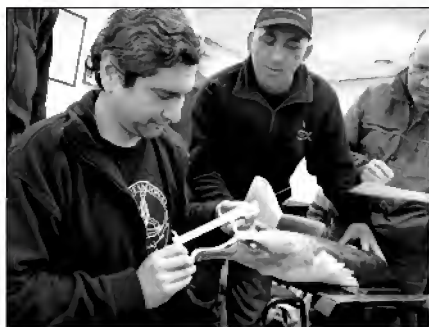
FIGURE 2. Training workshop on seabird identification and bycatch monitoring. ATF-Chile instructors are training IFOP's scientific observers.